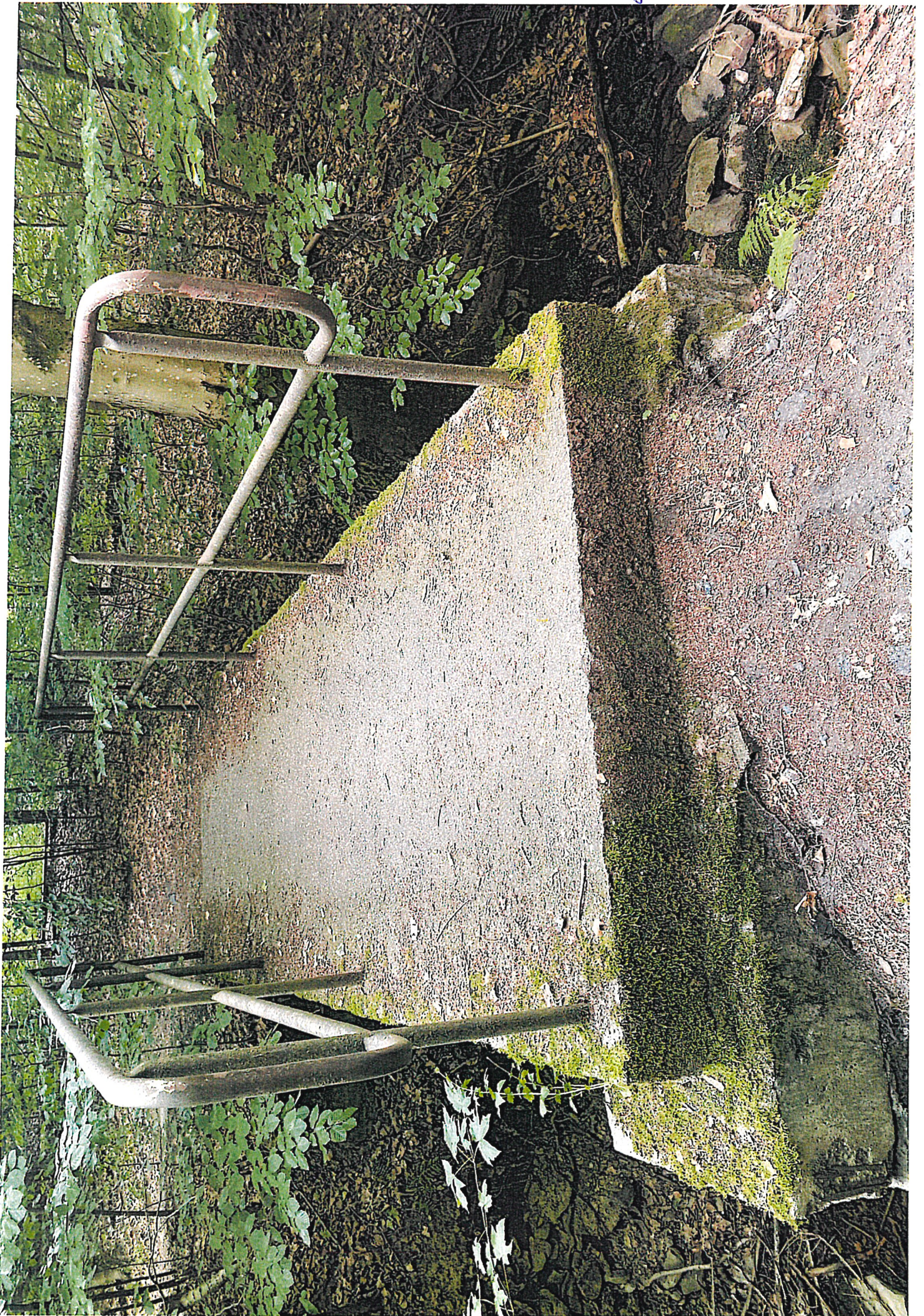
Anlage Brücke 3 Betonbrücke